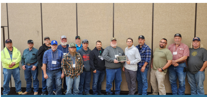
Best Unit Statewide - Belle Fourche