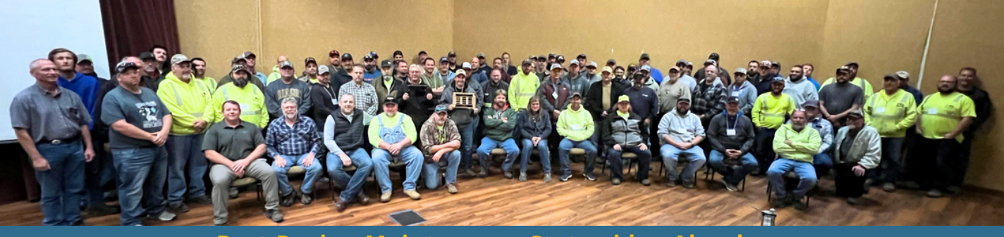
Best Region Maintenance Statewide - Aberdeen