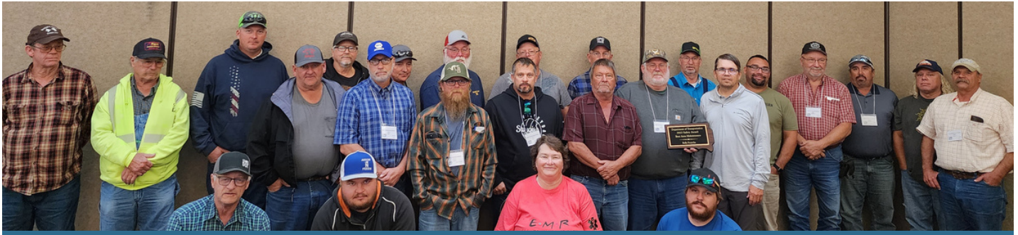
Best Area Maintenance Statewide - Belle Fourche