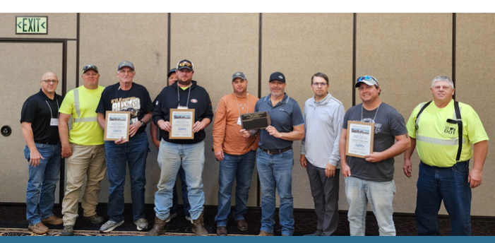
Best Unit Pierre Region - Herreid