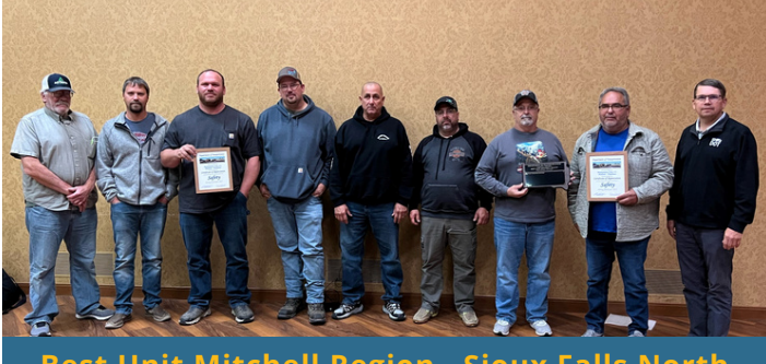
Best Unit Mitchell Region - Sioux Falls North