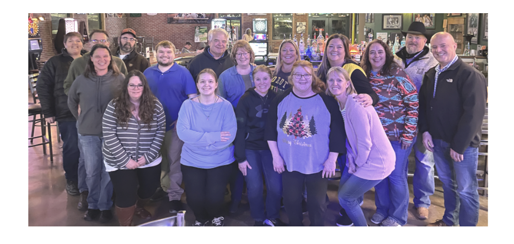
The Finance team , and significant others, recently celebrated a Christmas gathering together.

Their wedding celebration took place over several days and included multiple venues and many wedding outfits! Congratulations to the newlyweds!