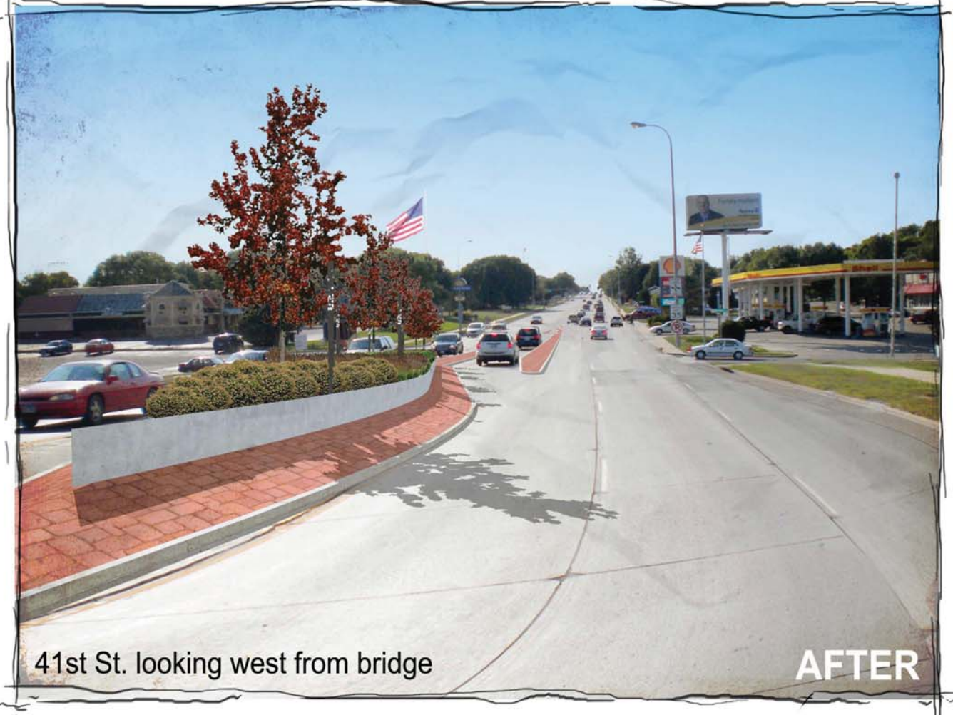
41st St. looking west from bridge