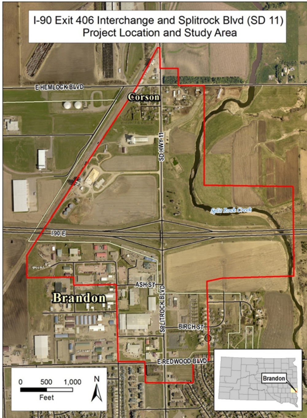
Figure 1. Project Location and Study Area

In order to provide capacity for future traffic demands, the South Dakota Department of Transportation (SDDOT) in 2010 conducted a “Decennial Interstate Corridor Study.” The study evaluated interchange needs across South Dakota and identified the I-90 Exit 406 interchange as a Mid Range Improvement priority. This bridge was constructed in 1960. A low slump dense concrete (LSDC) overlay was placed in 1985. The bridge is not considered structurally deficient