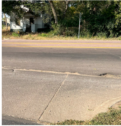
The pavement along the corridor is worn and continuing to deteriorate.