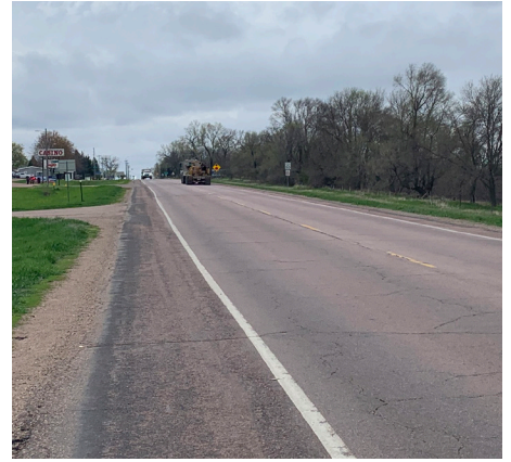
The current two-lane highway does not accommodate safe turning movements and lacks pedestrian accommodations.